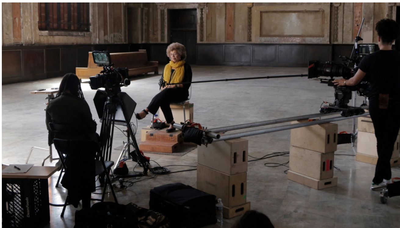
Behind the scenes shot of activist, philosopher, and author Angela Davis during the filming of “13th”

Attain Housing provides transitional housing, case management services, and rent assistance services to all vulnerable families with dependent children who are either experiencing homelessness or are at-risk of losing their housing due to hardships. Due to the historical and current systemic inequalities that exist within this country’s governing, financial, law enforcement, and employment systems, the majority of people seeking our housing services are people of color. Currently, 71% of the families in our housing program are people of color, with 59% of them being Black. 62% of recipients of Stable Home rent assistance funds are also people of color. Our staff and board of directors are predominately white. We realize we have a lot to learn about the inherent racism baked into our society. We want to keep the conversation going and learn about the context of the oppression and how we can more effectively work to promote greater equality.