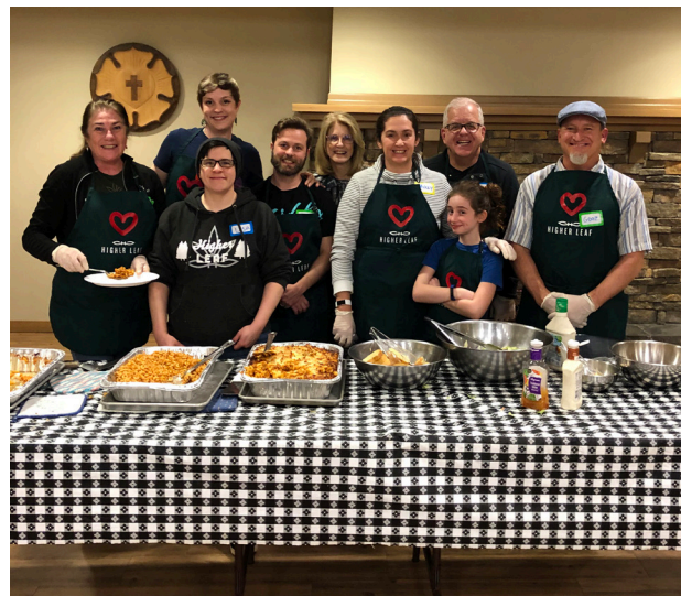
The Higher Leaf-Green Theory crew at their most recent Community Supper

Lizzie pointed out the fact that the cannabis industry is a disposable income market, which means that if someone can spend $50 at their shop, they often have an additional couple dollars to spare and will gladly donate to a cause they find important.