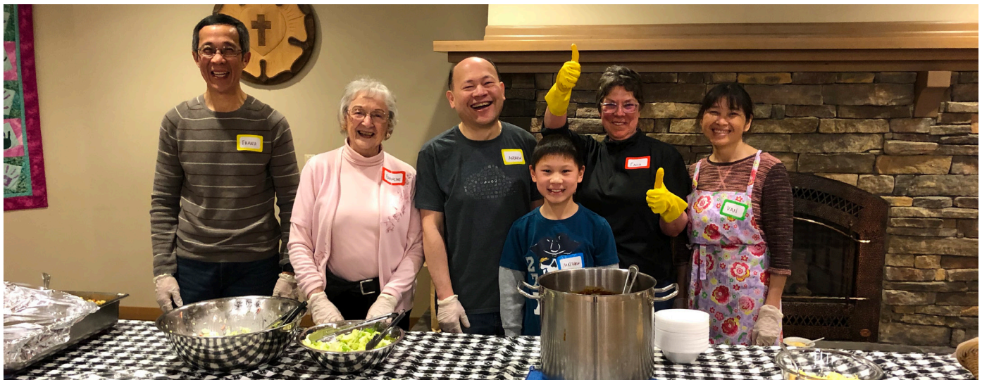
Two Thumbs up!