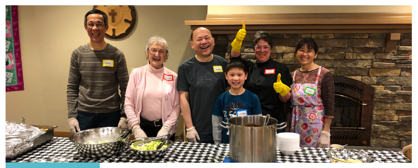
Two Thumbs up!

Ta-Da! Volunteers from Gates Ventures strut their stuff!